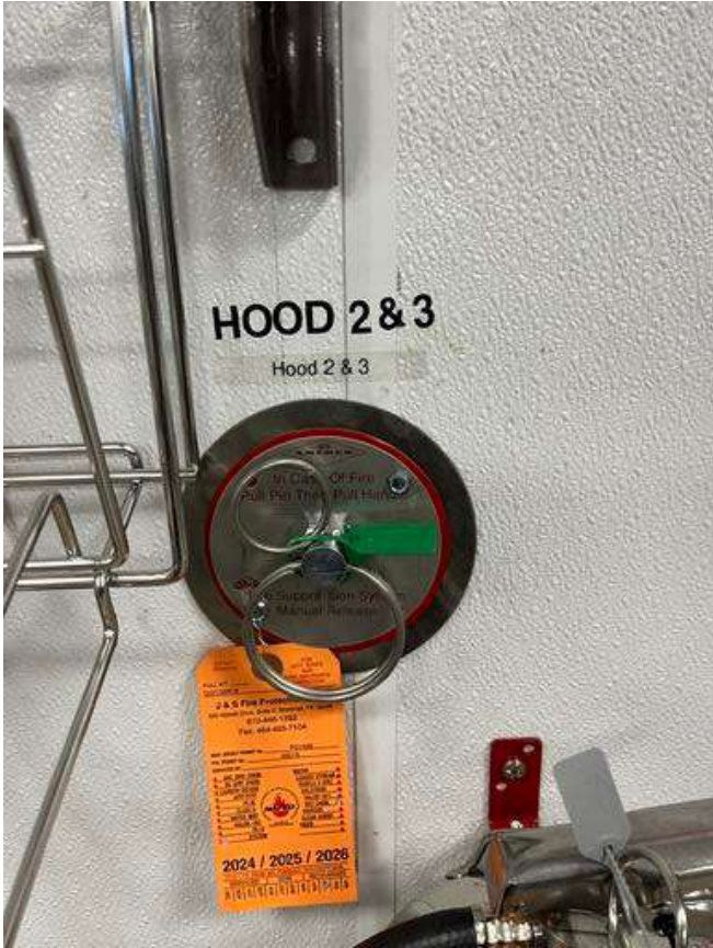
IMG_9704 Ian Fuller Mar 18, 2025 2:55 PM